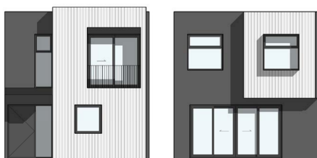
Front elevation Back elevation