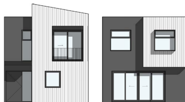
Front elevation Back elevation