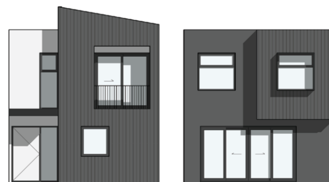
Front elevation Back elevation