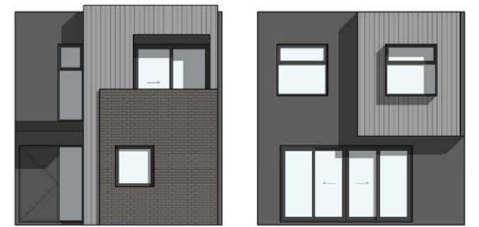
Front elevation Back elevation